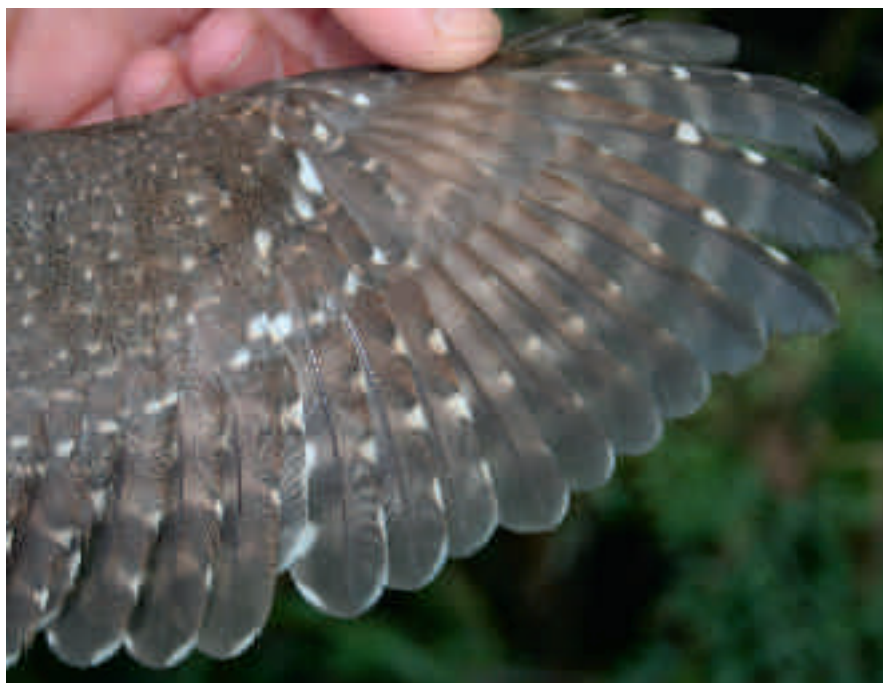
Figure 1. Differences between wings of immature (upper) and adult (lower) Pygmy Owls. Skillnader mellan vingar av juvenil (övre) och adult (nedre) sparvuggla.