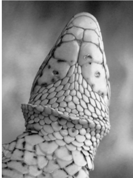
Fig. 3. Examples of the lizards marked using a medical cautery unit. We noticed each modification in the arrangement of scales. On the photograph specimens nr: “467/8” or “456/7 with double first scale”.

We noted any aberrations in the arrangement of scales (Fig. 3). Lizard visible on the photo has only eight scales, hence, counting in sequence, it may have the number “467/8”. However, it is only suggestion and because first two scales on the left side looks like one but double, the specimen could have a number “456/7 with double first scale”. The details depend on the researcher, however the numbers should be assign consistently. Only numbers with ascending digits were used, e.g. so that 12 and 21 are not mixed up, because each combination of the digits is used only once in the marked population. Lizards normally have nine mental and submandibular scales, hence the method provides at least 511 possible number of combinations, in case of 1-9 of dots cauterized. The total number of possible codes that can be marked using two dots, three dots or four dots is 36, 84, 126, respectively. However, these are minimum numbers of combinations, because additional possibility is when considerate any aberrations in the arrangement of scales, mentioned above (Fig. 3).