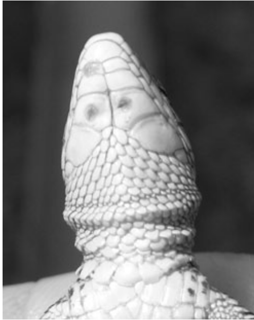
Fig. 4. The marks left on lizard scales re-captured after about one month (lizard no 156).