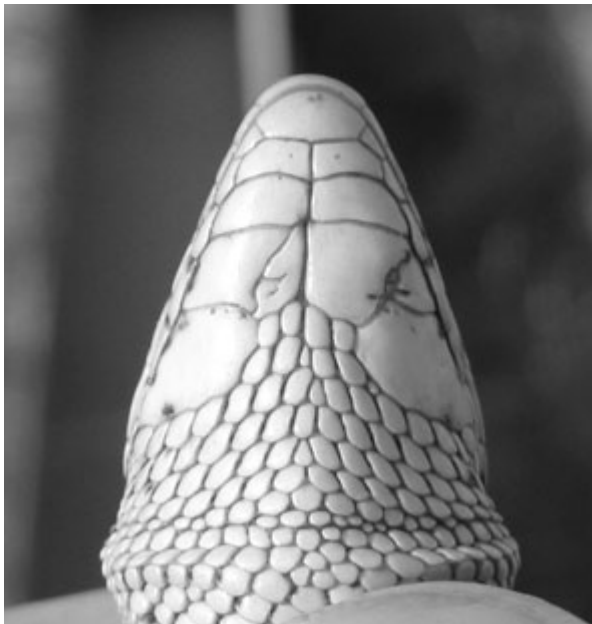
Fig. 5. The marks left on lizard scales re-captured after about one year (lizard no 56).