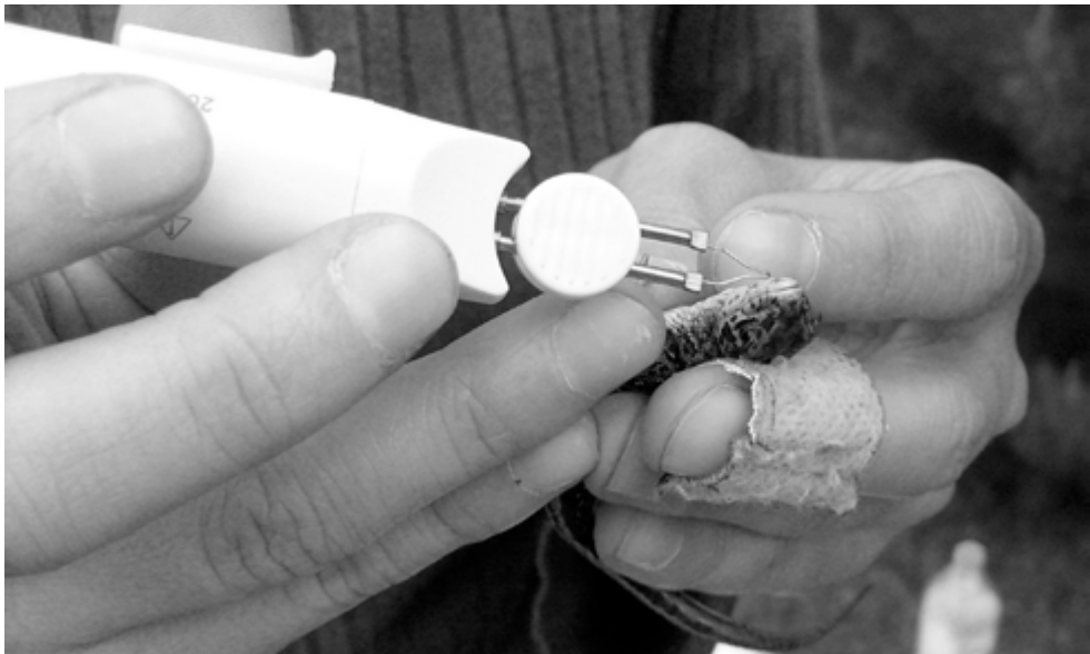
Fig. 1. Procedure of marking lizards using the medical cautery unit. Lizards are held in one hand and marks are left on mental and submandibular scales using the cautery unit held in the other hand.

We marked lizards with cauterized dots on the ventral surface of the lower jaw. We assigned appropriate digits to mental and submandibular scales, to form a unique numerical code (Fig. 2).